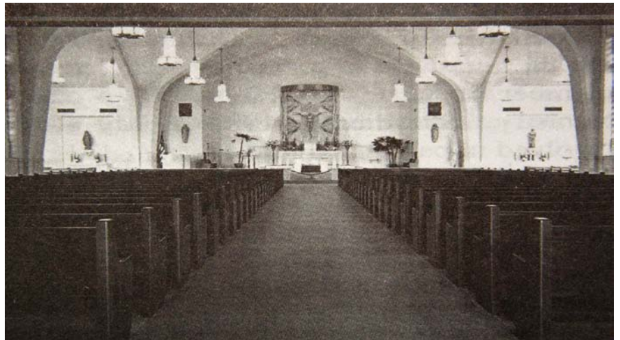
Church interior, 1981

By this time, Lyceum Hall was no longer usable, so the old church became the church hall.